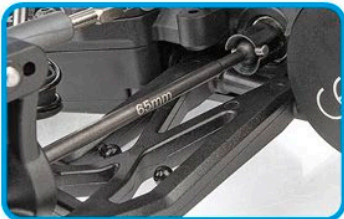
Rear CVA driveshafts for more reliability