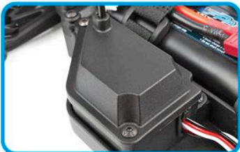
Water-resistant enclosed receiver box