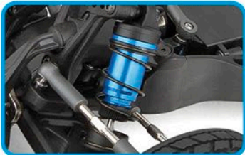
Aluminum 12mm big bore coil-over shock absorbers