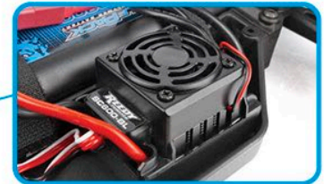
Water-resistant high-power Reedy brushless speed control with T-plug connector and LiPo low voltage cutoff