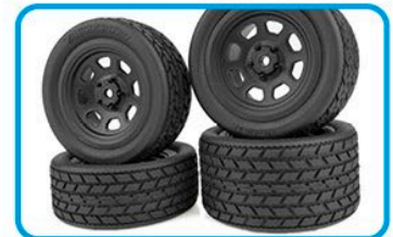
High-grip tires with street stock-inspired tread pattern