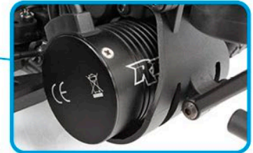
Powerful Reedy 3300kV brushless motor