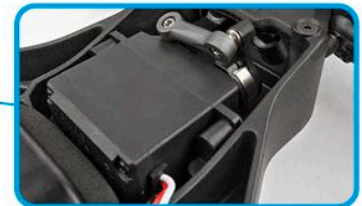
High-torque, metal-gear Reedy servo with spring-style servo saver