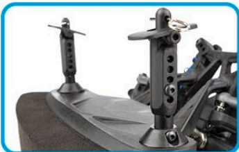
Adjustable body mounts