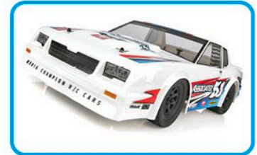
Factory-finished Street Stock body with integrated rear spoiler