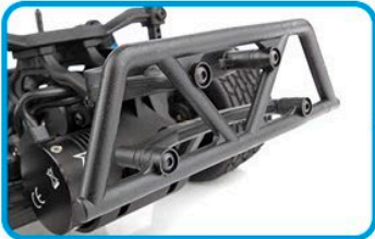
Impact-absorbing front and rear bumpers