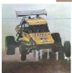
The prototype RC10 (right) and the full-size off-road buggy that inspired Roger Gault for the design and box art.