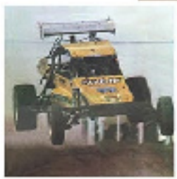
The prototype RC10 (right) and the full-size off-road buggy that inspired Roger Carle for the design and box art.