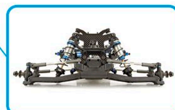
New gull wing front and rear arms and carbon fiber shock towers for improved high traction handling