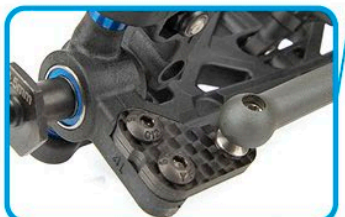
+1 carbon fiber steering block arms