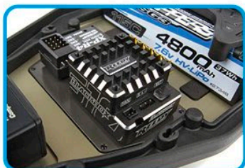
Factory Team 13g aluminum chassis weight