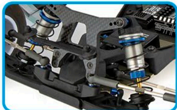
V2 12mm Big Bore threaded aluminum shocks with 3mm shafts, machined pistons and X-rings for improved smoothness