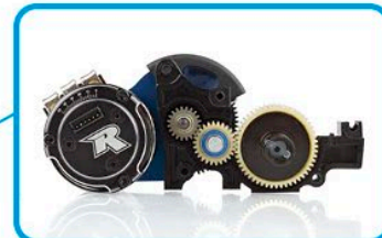
Both Laydown and Layback Stealth transmissions included for tuning weight bias