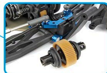
Easy-access differential with height adjustment using included 0, 1, 2, and 3mm inserts