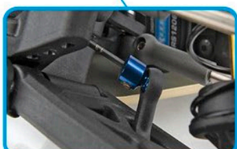
1.3mm front anti-roll bar and hardware included for added high-speed stability