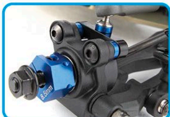
B74.1 two-piece rear hubs with aluminum upper caps for fine geometry adjustments