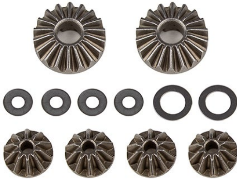
#92306 RC10B74 FT LTC Differential Rebuild Set, metal