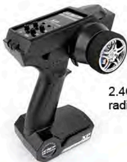
2.4GHz 2-channel radio system