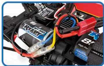
Includes 2.4GHz XP transmitter, receiver, Reedy Power water-resistant speed control, 380 motor, servo and 850mAh Li-Ion battery