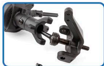
Metal front CVA axle shafts