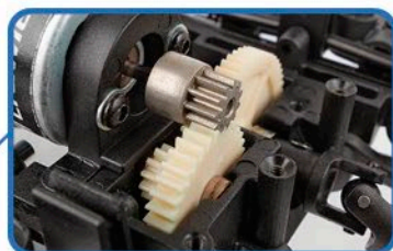
13.98:1 ratio 3-gear transmission with integrated motor mount