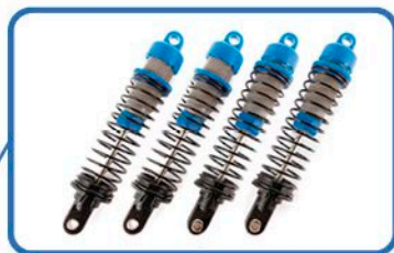
Fully adjustable threaded fluid-filled shocks