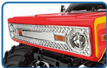
Injection-molded chrome grill and body accessories