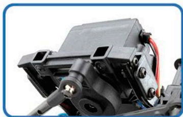
Chassis Mounted Steering (CMS) Servo