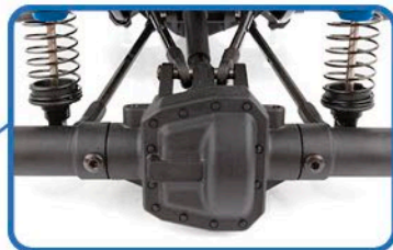
Metal 4-Link front and rear suspension