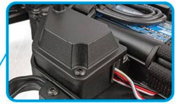
Water-resistant enclosed receiver box