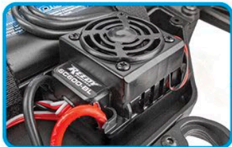
Water-resistant high-power Reedy brushless speed control with T-plug connector and LiPo low-voltage cutoff