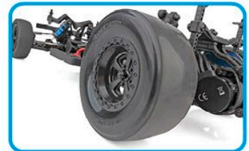
Lightweight drag race-inspired wheels wrapped with high-grip rear drag slick tires, 12mm hex

Due to ongoing R&D, photos may not match final kit. #70026 vehicle shown on these pages equipped with item NOT included in kit: Reedy battery.