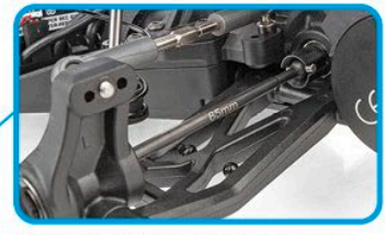
Rear CVA driveshafts for more reliability