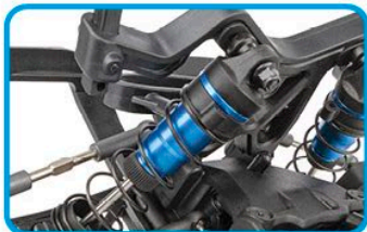
Aluminum 12mm big bore coil-over shock absorbers