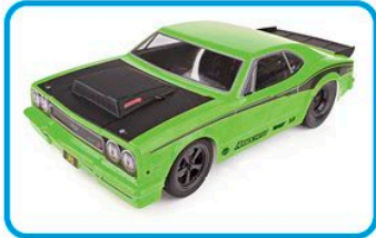
Factory-finished two-piece Reakt drag race body in Sublime Green with rear spoiler