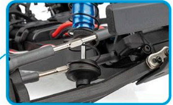
Rugged steel turnbuckles for adjustable camber and front toe-in