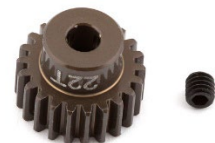
1340 (more top speed)