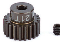
1339 (more top speed)